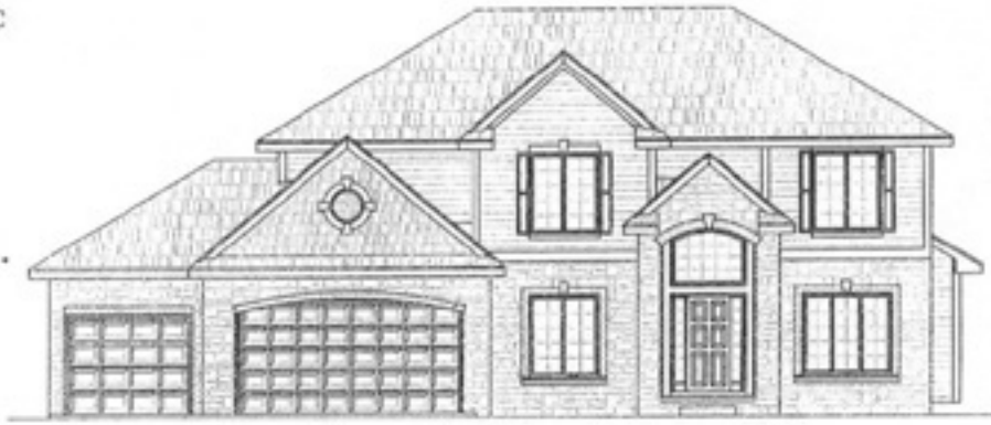
Floor Plan - Emiline Marquis III Square Footage - 3149 Finished Sq. Ft.