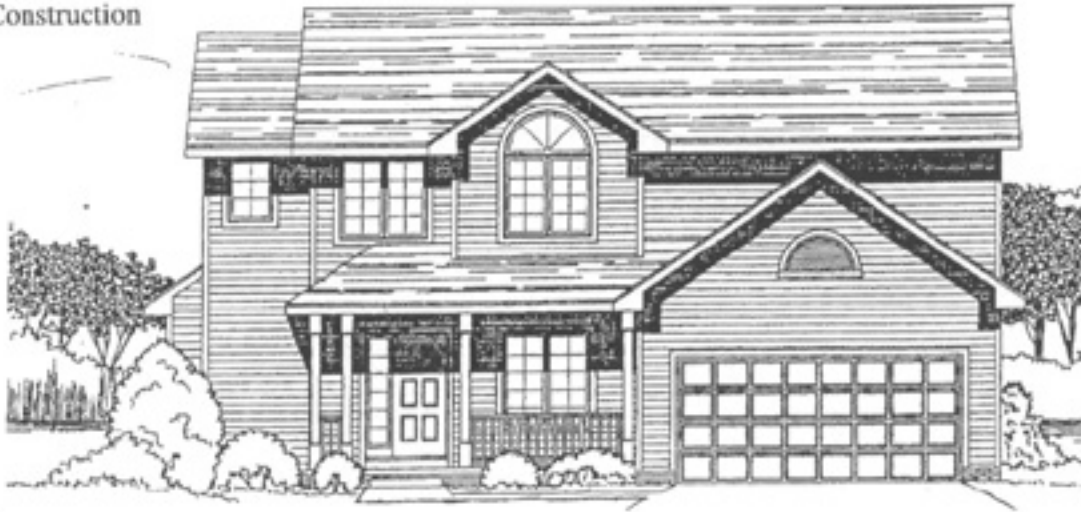
Floor Plan -- Two Story Square footage -- 2245 Sq. Ft.