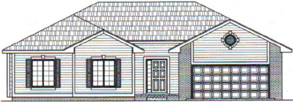
Floor Plan - 1615 Ranch Square Footage - 1615 Sq. Ft.