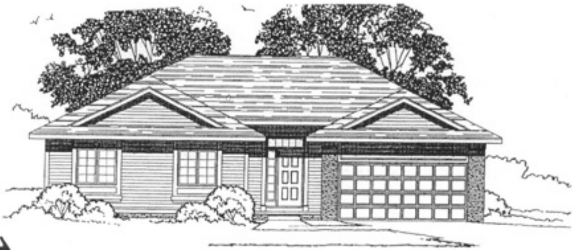
Floor Plan -- 1586 Ranch Square Footage - 1586 Sq. Ft.